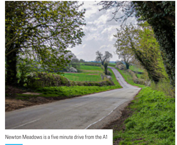
Newton Meadows is a five minute drive from the A1