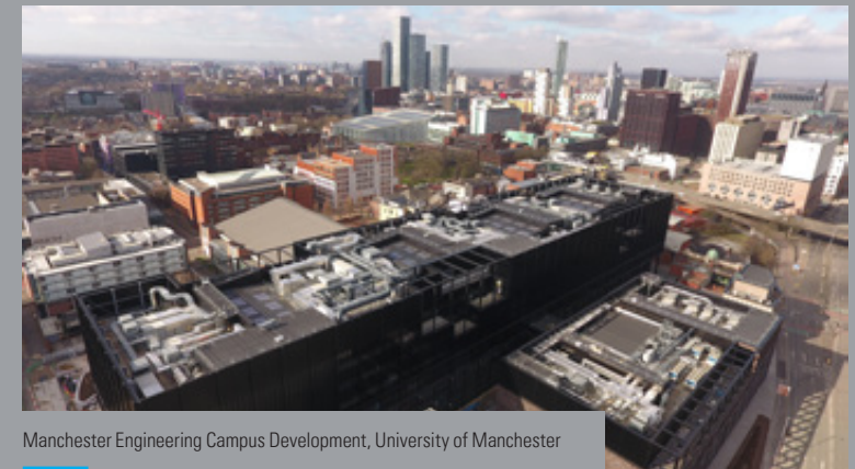
Manchester Engineering Campus Development, University of Manchester