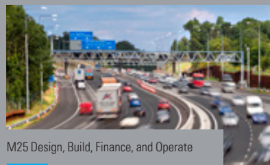
M25 Design, Build, Finance, and Operate