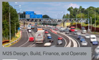
M25 Design, Build, Finance, and Operate